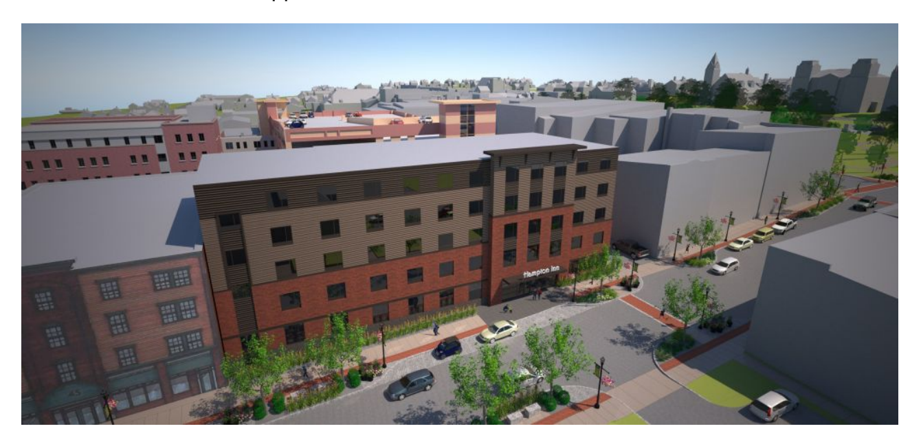
St. Albans - architect's rendering of proposed Hampton Inn (currently under construction)

None of this would have happened without TIF.